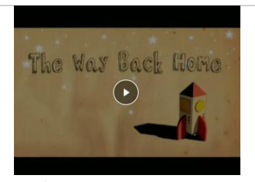
The Way Back Home (journeys, adventure, home, cooperation, friendship)